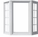
Bay Window w/Casement Vents