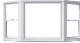
Bay Window w/Double-hung Vents