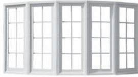
Five-section Bow w/Casement Vents