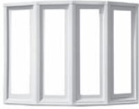
Four-section Bow w/Casement Vents